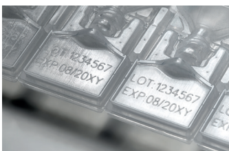
Pin-sharp codes on plastic materials, ideal for wide marking fields

Power is key to increase speed while achieving superior print quality.