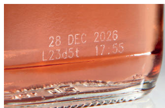
Excellent code quality on glass and other demanding materials