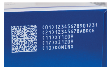
GS1 compliant codes for serialisation

*coding speed depends on the individual application; Dx-Series has been benchmarked against Domino D-Series