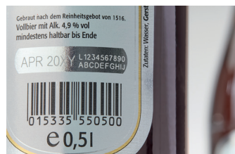
Marking speeds up to 90k bottles per hour on paper labels